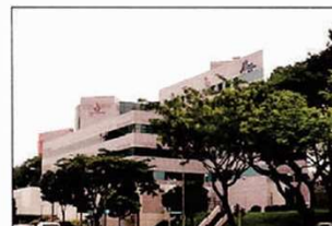
Health Promotion Board, Conference venue

The following speakers from AFSUMB attended the workshop as AFSUMB Faculty: