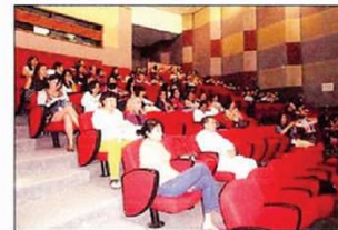
The workshop was well organized and well participated