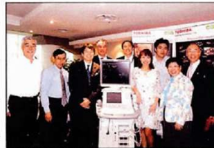
Faculty members are seeing one of products