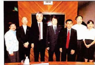
The attendees of the AFSUMB EC Meeting