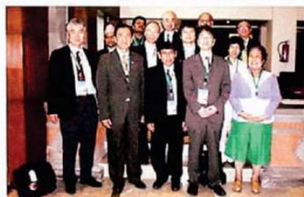
AFSUMB Education Committee meeting in Bali

President and Secretary of the AFSUMB are Ex-officio Members of the EC.