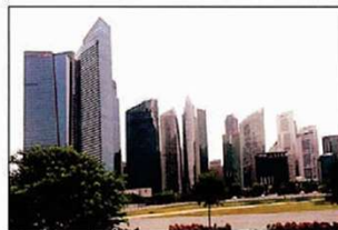
Singapore an important member of AFSUMB

AFSUMB has completed its 11 th Workshop successfully in Singapore on 28 & 29 September 2013, Saturday & Sunday at the Health Promotion Board, Outram Campus, Singapore General Hospital, Singapore